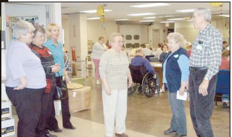
Community Tour of the industries