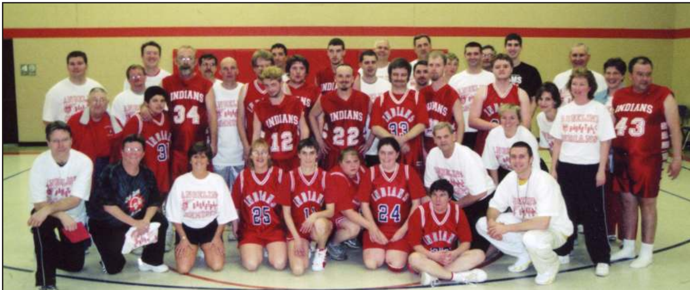
March 14th - Community All-Stars vs. The Angeline Indians basketball game. Better luck next year "All-Stars."