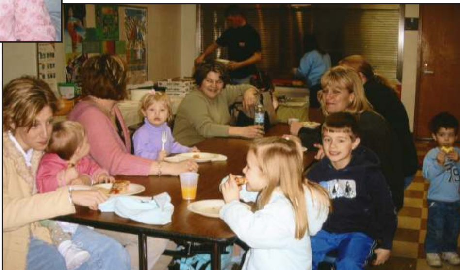
Public awareness goes down so much smoother when there is plenty of food on hand.