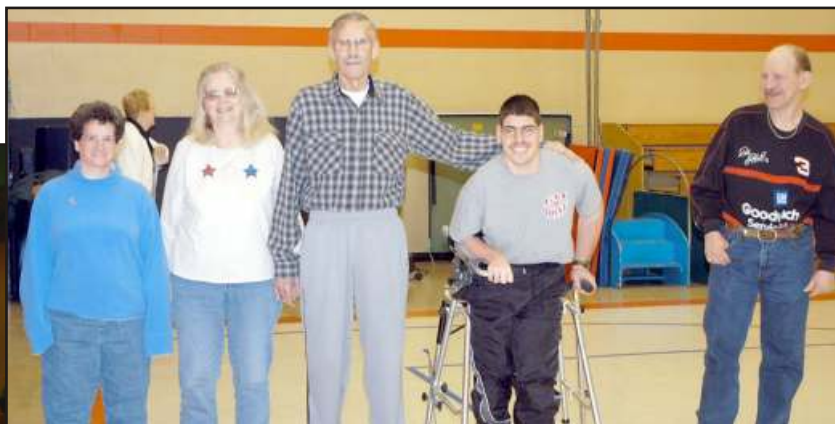
Opening the gym to the community.